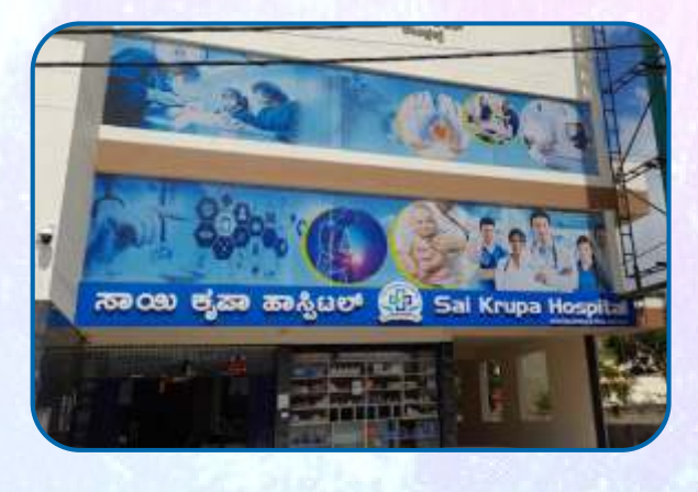
Sai Krupa Hospital