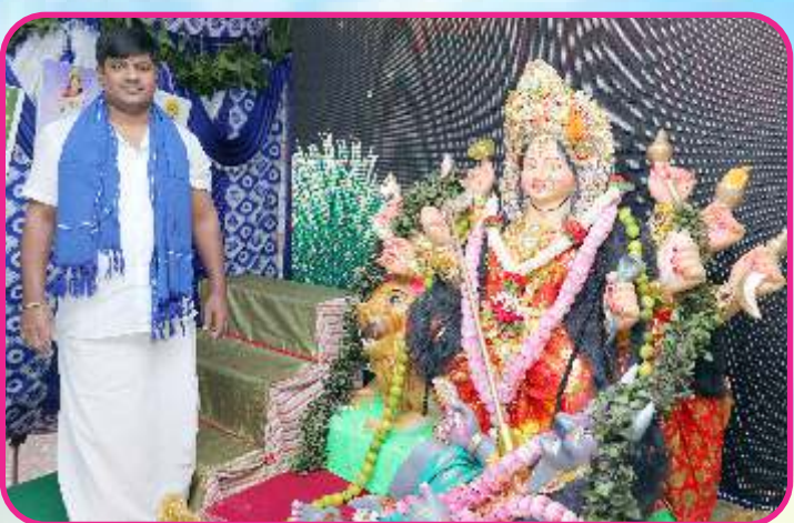
Cultural & Sports Events